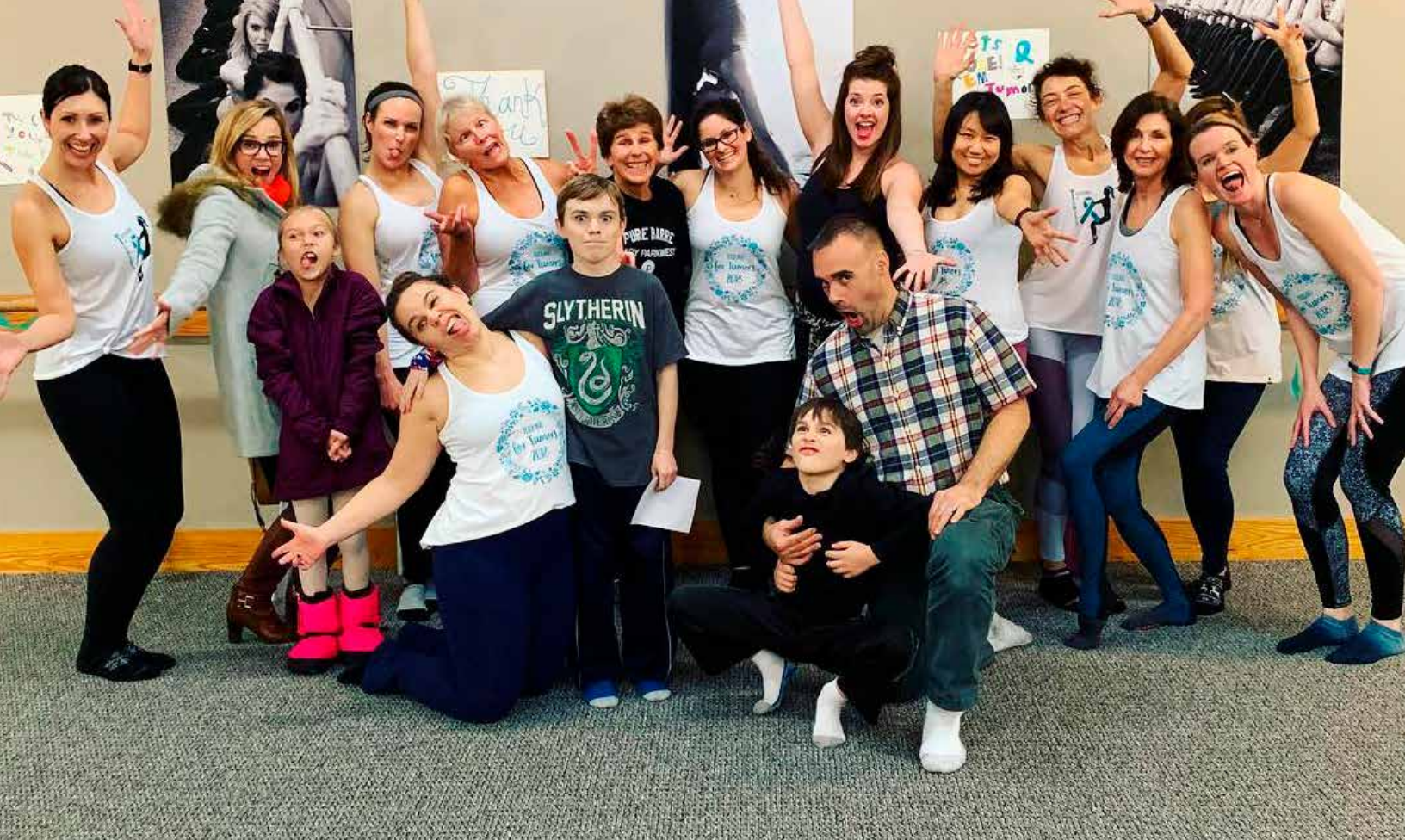
2017 Tucking for Tumors Fundraiser