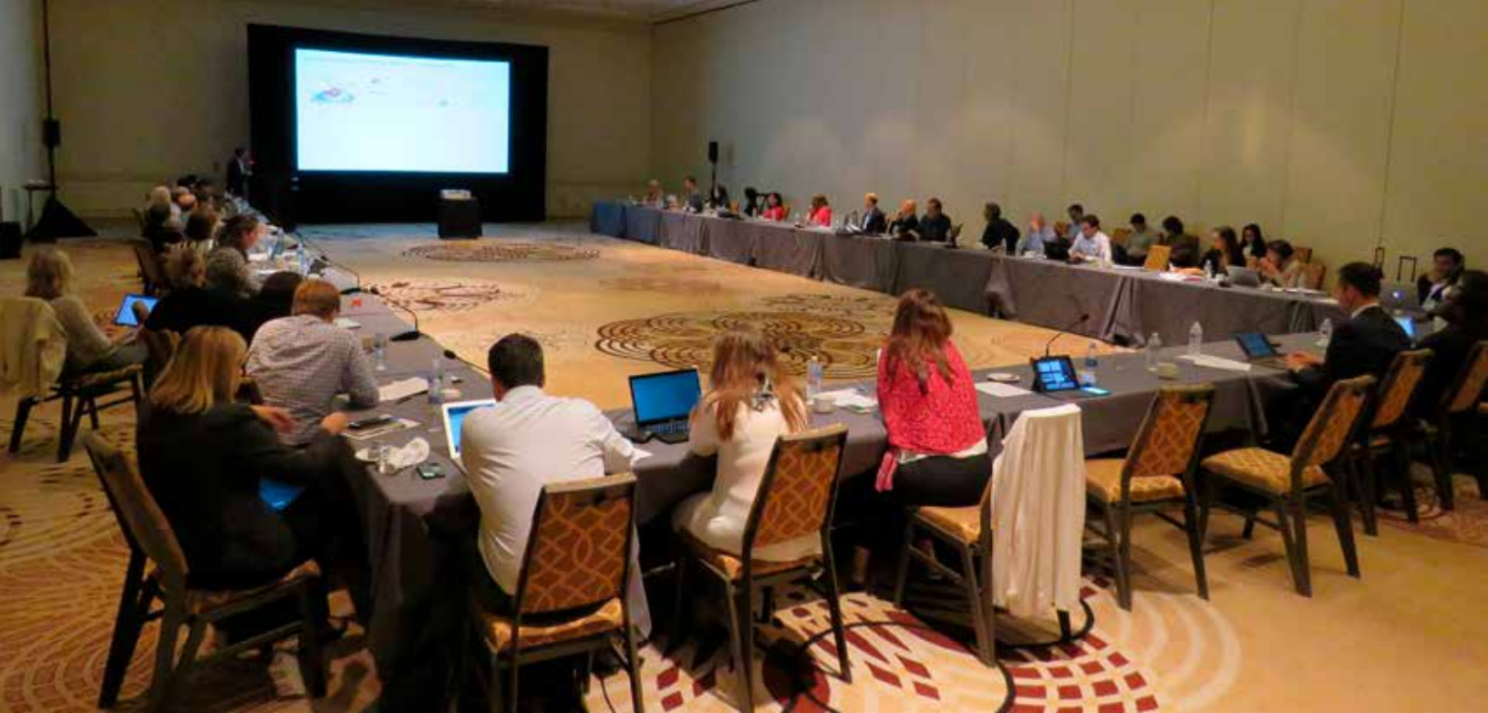
2018 DTRF Research Workshop