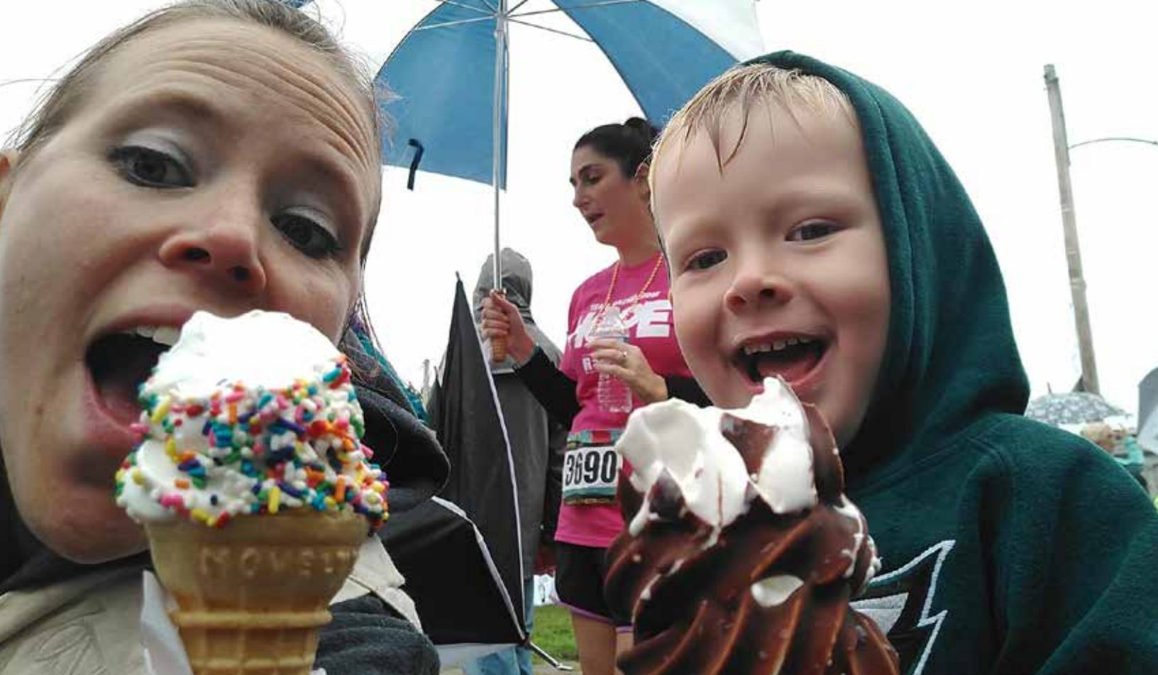
2018 Running for Answers 5K