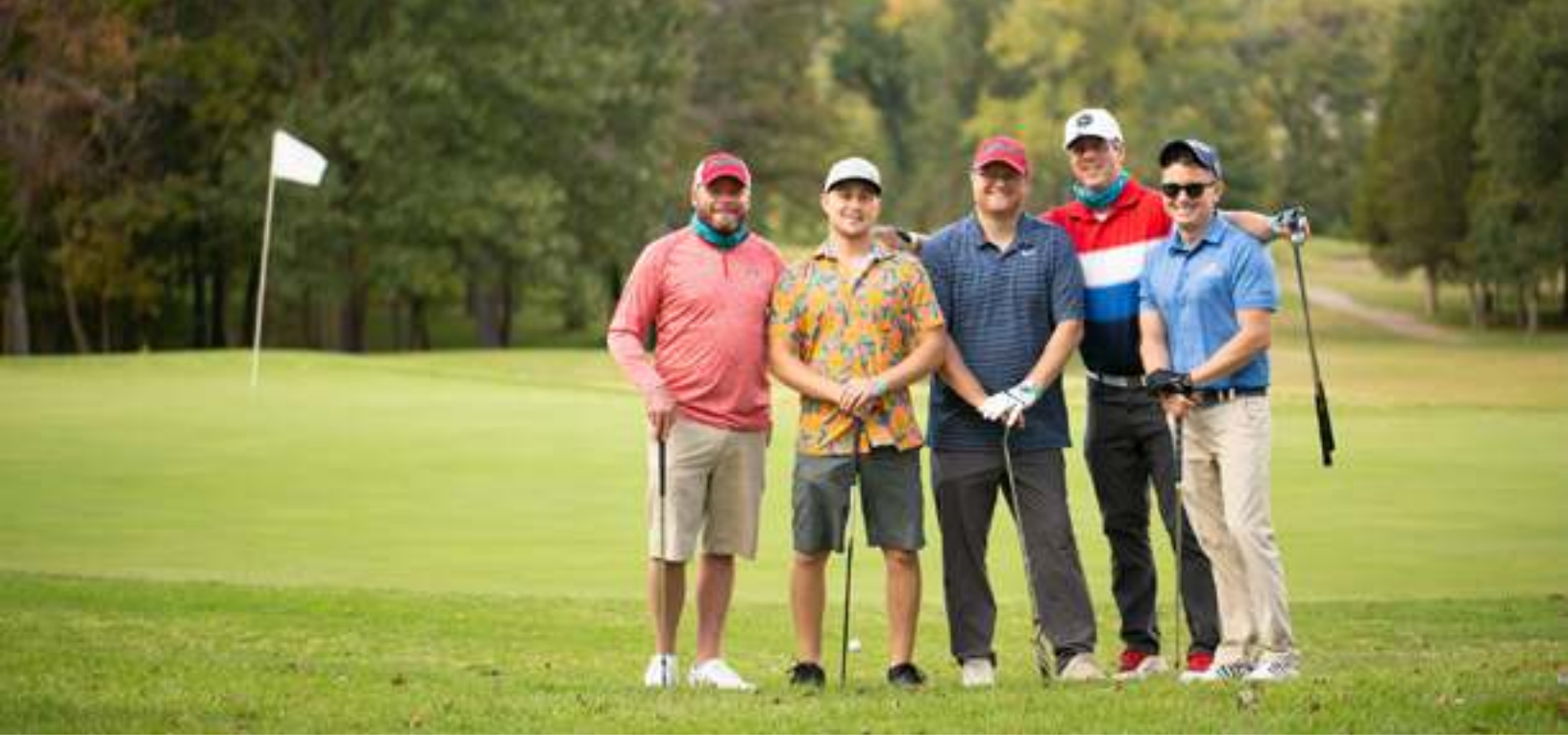
Swing for a Cure Event - Sept 28, 2020