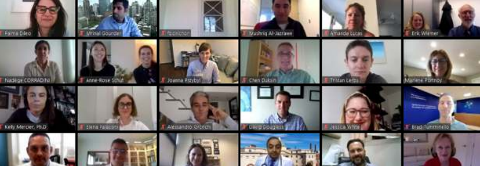
Together We Will Virtual Weekend, Sept. 25-27, 2020