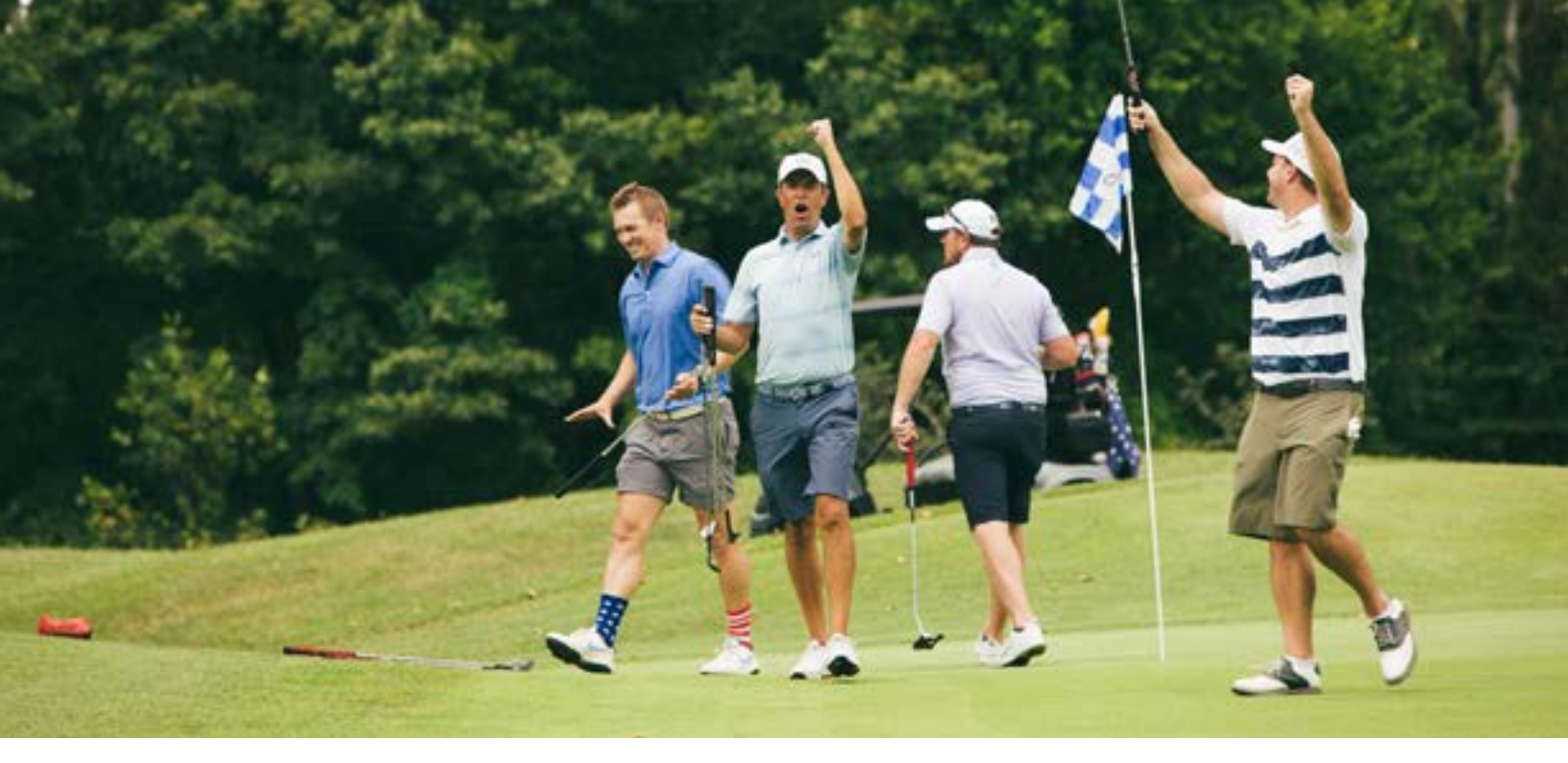
Swing For A Cure - St. Louis (August 2021)